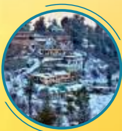
KASALI HIMACHAL PRADESH