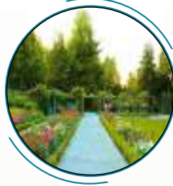
ZAKIR HUSSAIN ROSE GARDEN