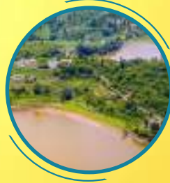
MORNI HILLS HARYANA