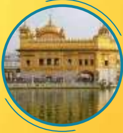
GOLDEN TEMPLE AMRITSAR